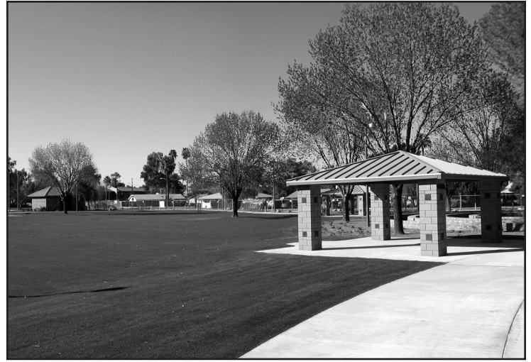
Hudson Park goes "green". What a welcome sight it was to see the the sod laid down. In 90 days the fence should come down and we can enjoy it. Go to our Web site, www.hudsonmanor.org to see color photos of the park construction progress.